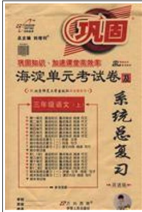
Filesize: 3.91 MB